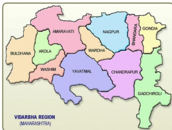
Fig 2: Map of Vidarbha Region of Maharashtra

From each village 10 adopted seed cocoon rears (ASR) and 10 non-adopted seed cocoon rears (NASCR) were selected randomly totaling to 50 Adopted Seed Cocoon Rears (ASCR) and 50 Non-Adopted Seed Cocoons Rears or private rears (NASR) with a total sample size of 100. Each Adopted Seed Cocoon Rearer was supplied 300 Disease Free Laying (Dfls) of Tasar silkworm of Dabha TV (Tri-Voltine) race for all the three crops from BSMTC, Bhandara and rearings were conducted in outdoor condition on the foliages of Terminalia tomentosa and Terminalia arjuna . The non-adopted seed cocoon rears were supplied 300 Dfls produced at BSM&TC, Bhandara through the District Sericulture Departments of respective districts. The Non-Adopted Seed Cocoon Rears conducted rearing without adopting any rearing technology (control) while Adopted Seed Cocoon Rears adopted the improved tasar silkworm rearing technologies (treatment) as detailed below: